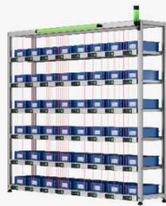
Shaped material Rack