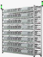
Smart reel Rack